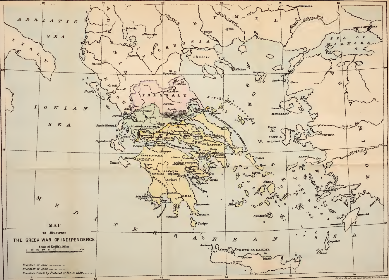
MAP to illustrate THE GREEK WAR OF INDEPENDENCE

Scale of English Miles 0 10 20 30 40 50 100